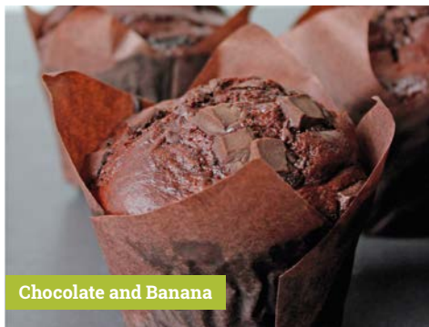
Chocolate and Banana