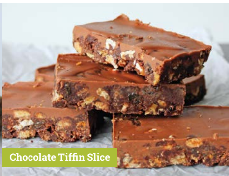
Chocolate Tiffin Slice