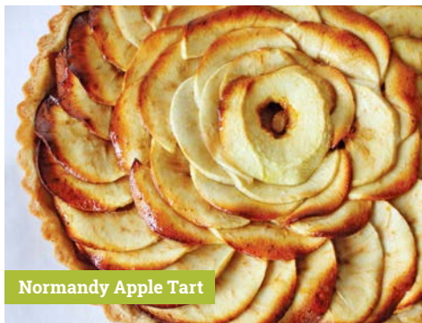
Normandy Apple Tart