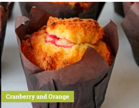
Cranberry and Orange