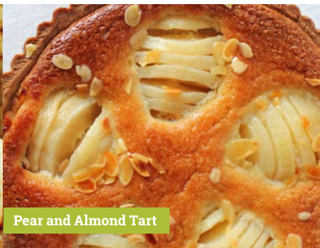
Pear and Almond Tart