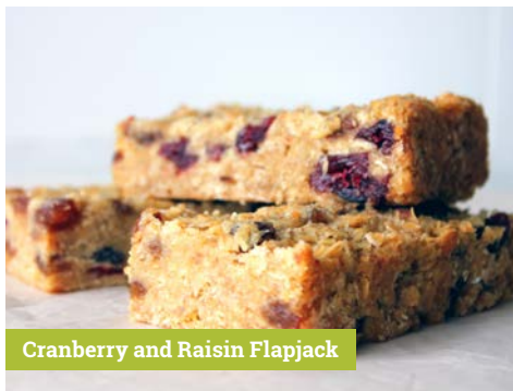
Cranberry and Raisin Flapjack

Oats, nuts, cranberries, sunflower and pumpkin seeds, flavoured with cinnamon and sweetened with honey.