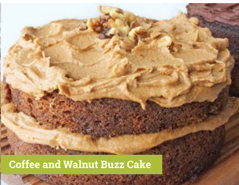
Coffee and Walnut Buzz Cake